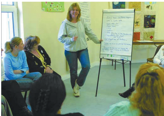
Training for the Co-Operation Fingal Primary Health Care Programme.

This Project is a partnership between Co-Operation Fingal Traveller Programme and the Northern Area Health Board.