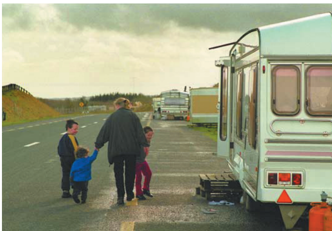
The living conditions of Travellers is probably the single greatest influence on health status - the National Traveller Health Strategy.

The National Traveller Health Strategy acknowledges some of the key determinants of health exist outside the formal health care sector and states that 'there is little doubt that the living conditions of Traveller health are probably the single greatest influence on health status'.