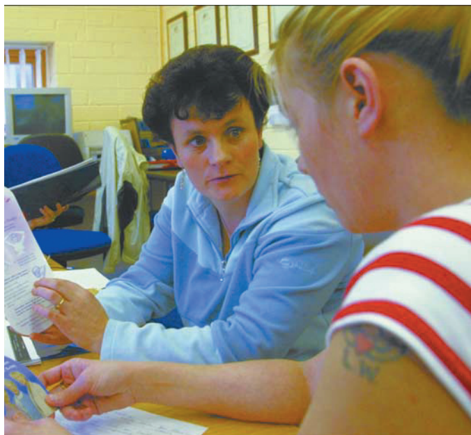
Members of the Tallaght Travellers Primary Health Care Programme.

The Tallaght Project was established in November 2001 and is a partnership between the Tallaght Travellers Community Development Project and the South Western Area Health Board.