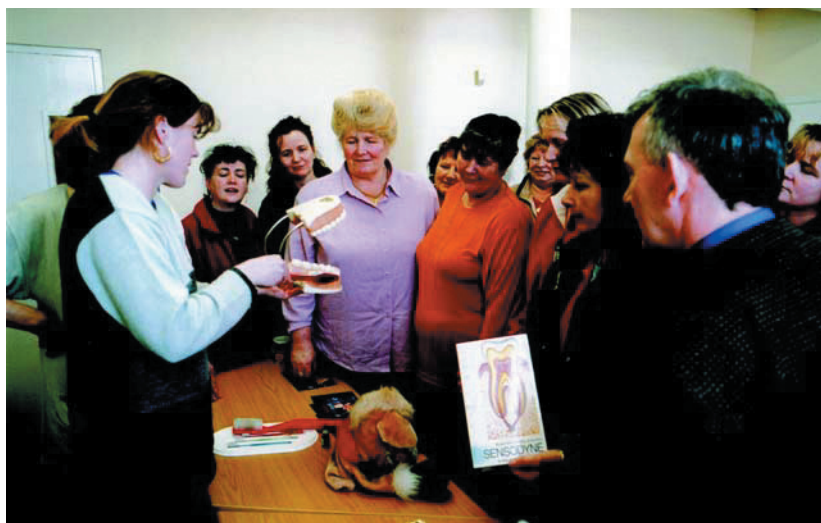
Pavee Point Primary Health Care for Travellers Project.

'Primary Health Care for Travellers Projects will be developed in conjunction with Traveller organisations in all Health Board areas where there is a significant Traveller population', National Traveller Health Strategy 2002-2005.