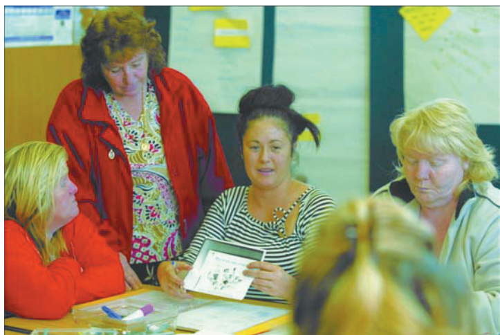
St. Margaret's Primary Health Care Project Workers have undertaken training in health as a human right.

This project is a partnership between St. Margaret's Travellers Support Group and the Northern Area Health Board. It consists of 9 Traveller women due to complete their training as community health workers in June next year and 9 women who commenced training this year.