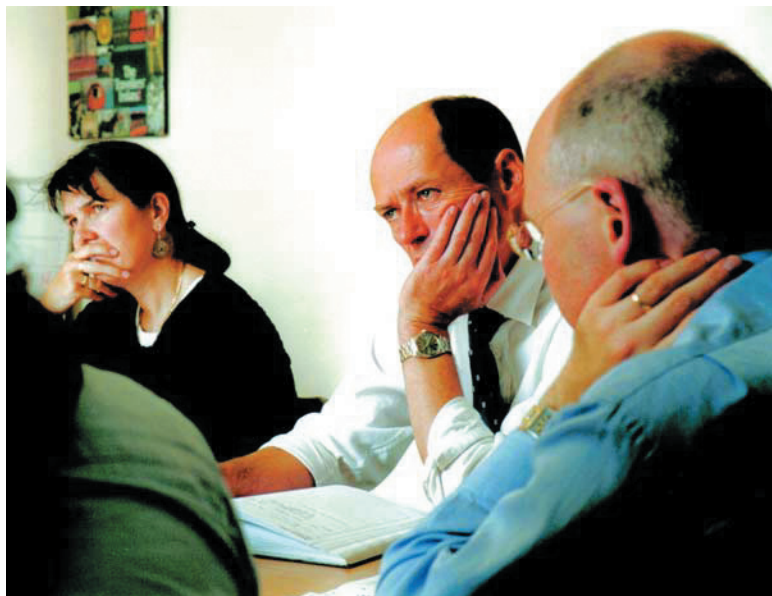
Members of the Consanguinity Sub-Group at work.

The work of the consanguinity sub-group arose out of a ban on first-cousin marriages between Travellers by a Catholic bishop, based on prejudices regarding the genetic impact of cousin-marriage.