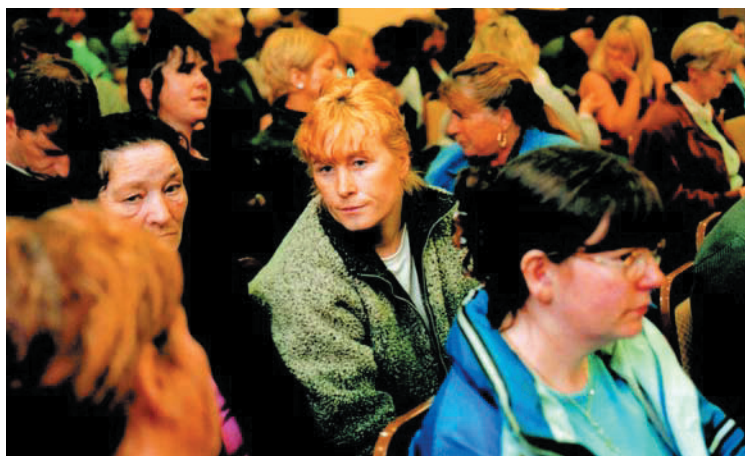
The launch of the first report of the Traveller Health Unit in the Eastern Region.

A similar representative role was encouraged among the professions represented on the Unit from among health board personnel.