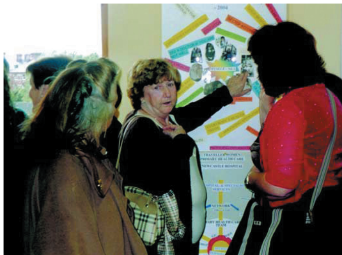
The Newcastle Primary Health Care Programme was established this year

This project is a joint project between Bray Travellers Development Group, Wicklow Travellers Development Group and the East Coast Area Health Board and was established this year.