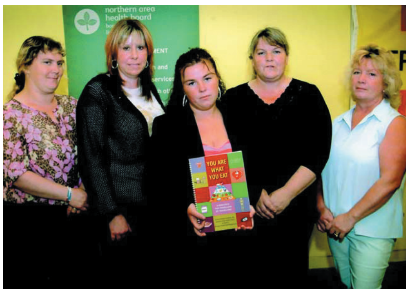
TravAct Community Health Workers at the launch of their training booklet on nutrition.

Having completed three years of training the Community Health Workers are important role models for other trainees and are involved in delivering training to other Traveller women in the Project.