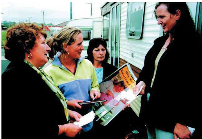
Traveller Community Health Workers with Pavee Point Primary Health Care for Travellers Project.

The work of the Project is guided by a Steering Committee made up of representatives of both partners.