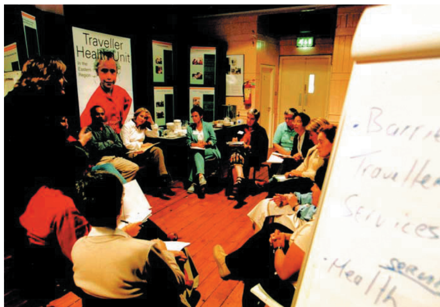
Networks are an important support structure to the Traveller Health Unit in the Eastern Region.

The Eastern Regional Traveller Health Network developed out of a sub-group of the Dublin Accommodation Coalition for Travellers (DACT). This network is an important forum for all those involved in Traveller health to exchange information and receive feedback on the work of the Traveller Health Unit in the Eastern Region. The Network was set up, in its own right since 1999 and meets on a monthly basis.