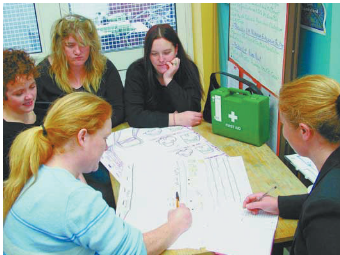
STAG Primary Health Care Project conducted a survey on the health needs of Travellers in the area.

STAG Primary Health Care Project is a partnership between STAG and the East Coast Area Health Board with 6 Traveller Community Health Workers.