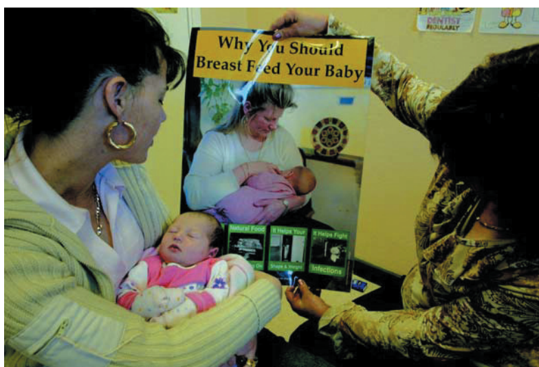
Work was carried out with mid-wives at the Rotunda Maternity Hospital on cultural issues.

The course was offered on a national basis and provided 240 course contact hours for 15 participants from all over the country. In this way consistency in terms of Primary Health Care for Traveller Projects was promoted.