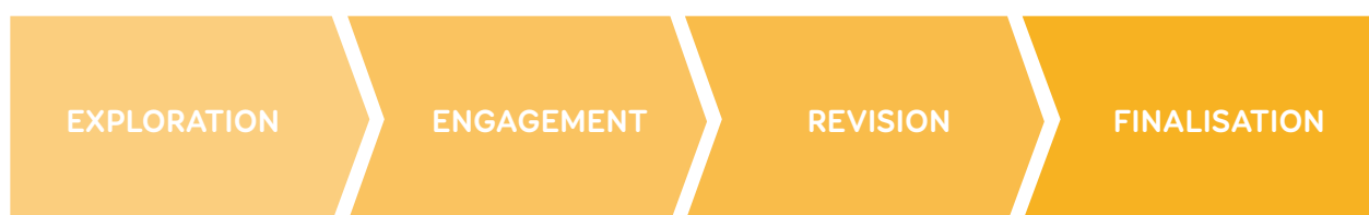
Figure 1: Process Summary

A modified consensus building process was undertaken by the HaPAI to prioritise indicators of healthy and positive ageing for Irish Travellers. The objective of this process was to identify any further aspects of positive ageing that members of the Traveller community considered relevant to this monitoring framework. The intended outcome was the inclusion and/or modification of relevant indicators which can be added to the positive ageing indicators. This process involved four steps which are summarised below.