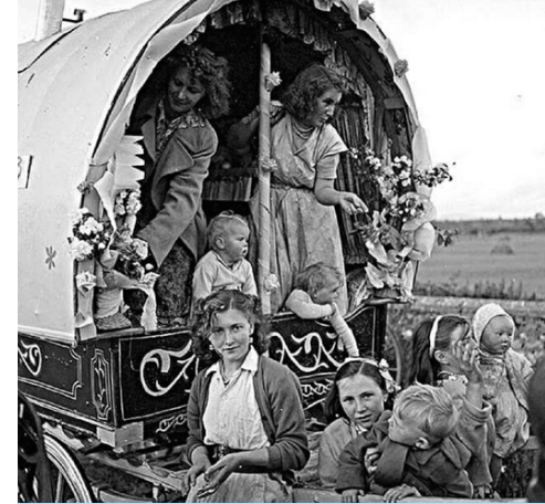
The Caravan Parade (renamed the National Romany Caravan Parade) Cahirmee fair, Buttrvant Co. Cork

Traveller history and culture is a diverse and complex subject, there is not one story to define Traveller identity, but many. There is not one Traveller community but many communities. There is not one site where Traveller culture is located but many.