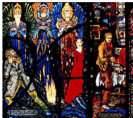
Harry Clarke, Geneva window, completed 1931 Wolfsonian Foundation Miami Florida

(front cover) The schools collection 1937-8 National Folklore Collection University College Dublin