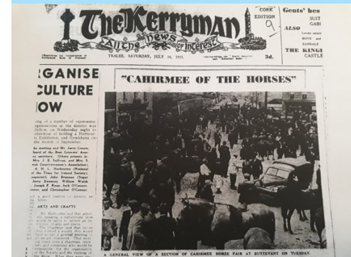
The Kerryman, Cork edition 16 July 1955