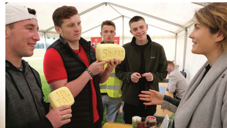
Above: Men's Health Day was held as part of Traveller Pride.