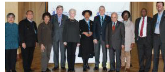
UN Committee for the Elimination of Racial Discrimination all wearing the Traveller ethnicity pin.

We also registered on the Lobbying Register and provide regular reports via www.lobbying.ie