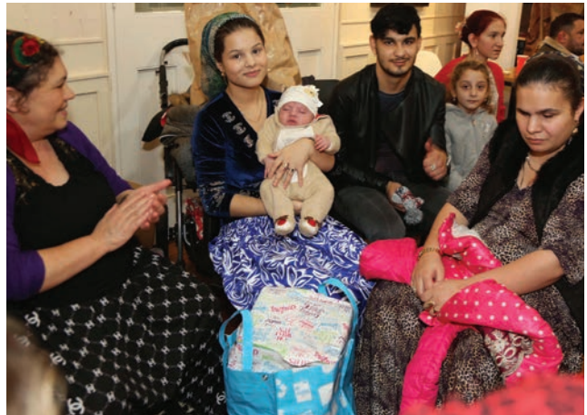
Roma families attend our Roma Christmas event in 2016.