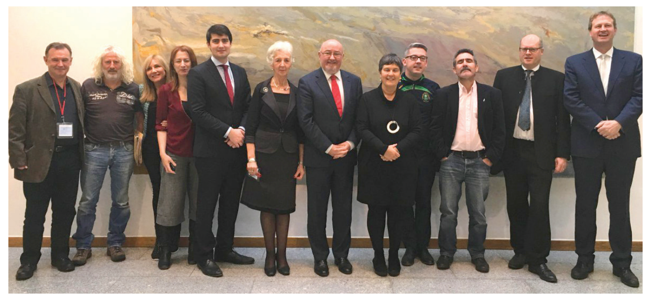
Pavee Point delegation at the Oireachtas Committee on Equality and Justice.